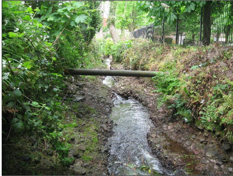
Plate 13.5: Deeper eroded channel in Ballybrack Stream in Douglas Community Park, looking north