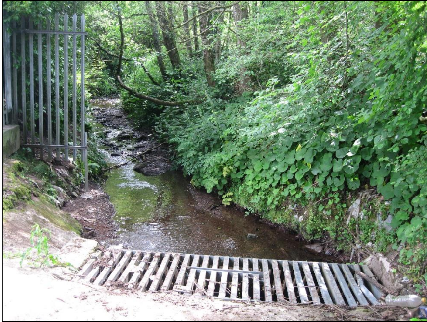
Plate 13.19: Tramore River in Lehenaghmore Industrial Estate, looking southwest