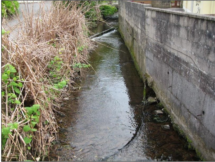
Plate 13.13: Ballybrack Stream in Ravensdale between Middle and Upper Ravensdale Bridges, looking south