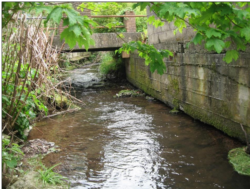
Plate 13.14: Ballybrack Stream in Ravensdale showing Upper Ravensdale Bridge, looking south