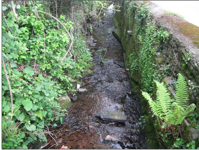
Plate 13.21: Tramore River adjacent to the Lehenaghmore Road, looking north