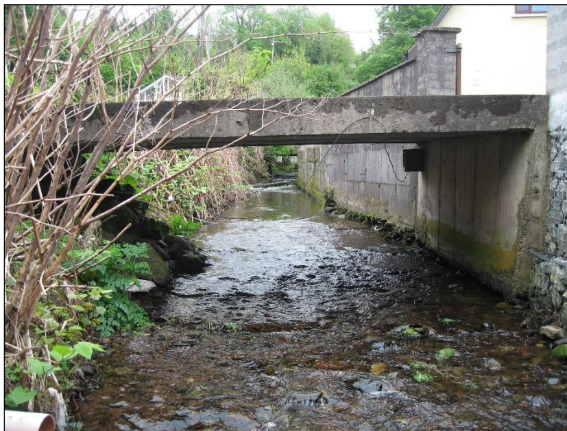
Plate 13.12: Ballybrack Stream in Ravensdale showing Middle Ravensdale Bridge with Upper Ravensdale Bridge in background, looking south