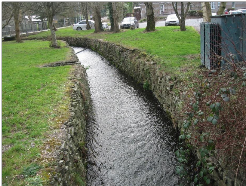
Plate 13.8: Ballybrack Stream running along Church Road with bridge to Ballybrack Wood in background, looking east