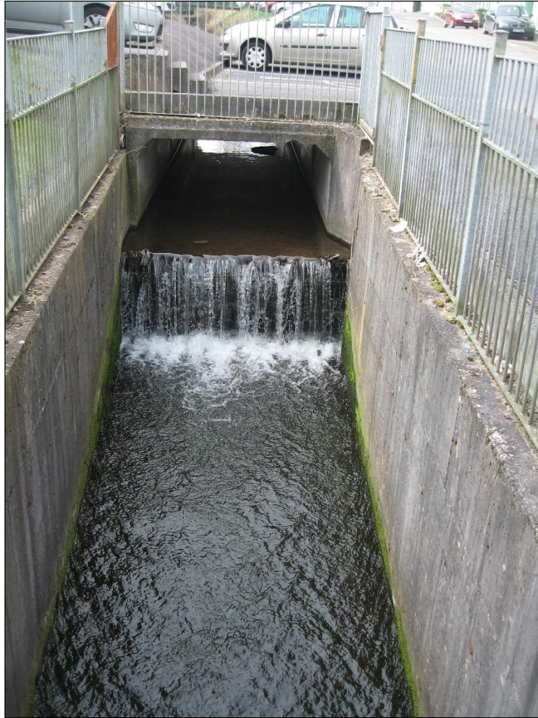
Plate 13.3: Eastern section of Grange Stream, looking west