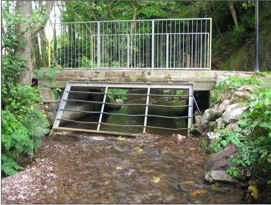
Plate 13.15: Ballybrack Stream in Ballybrack Wood showing bridge and trash screen, looking north