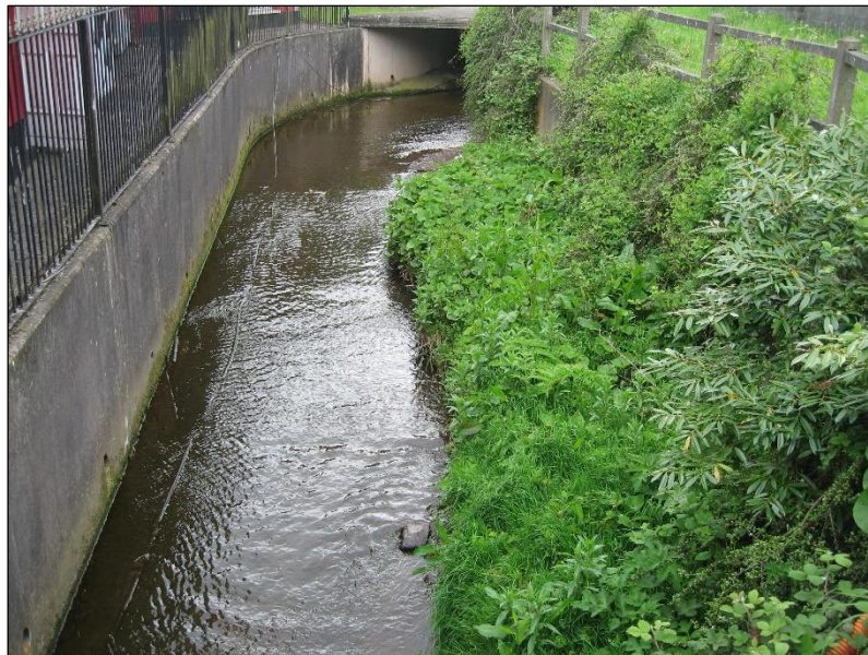
Plate 13.24: Tramore River emerging from under Togher Road to the north of Greenwood Estate, looking west