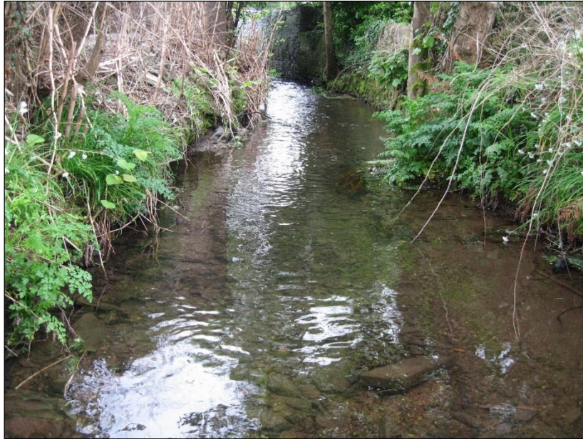
Plate 13.11: Ballybrack Stream in Ravensdale between Lower and Middle Ravensdale Bridges, looking south