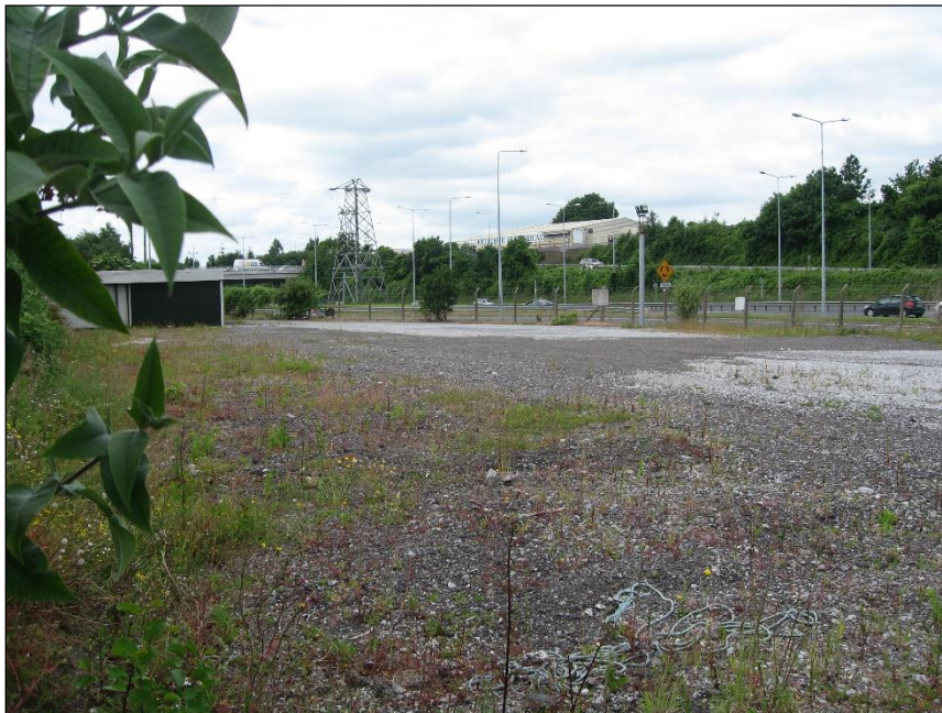
Plate 13.26: Proposed compound for Togher area, looking northwest