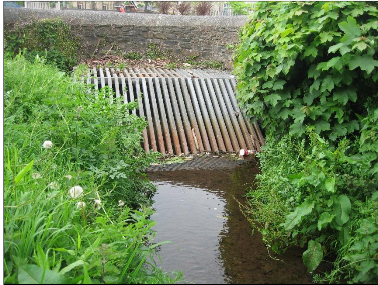
Plate 13.23: Tramore River entering culvert running under Togher Roundabout