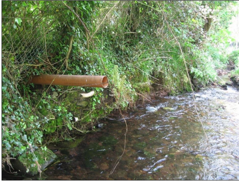
Plate 13.7: One of the outfall pipes discharging into Ballybrack Stream in Douglas Community Park, looking south