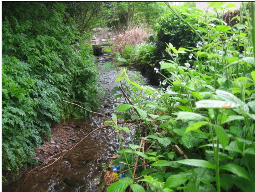
Plate 13.10: Ballybrack Stream in Ravensdale with Lower Ravensdale Bridge in background, looking south