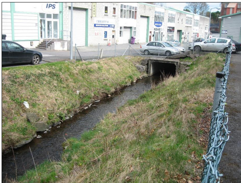
Plate 13.1: Western section of Grange Stream, looking east