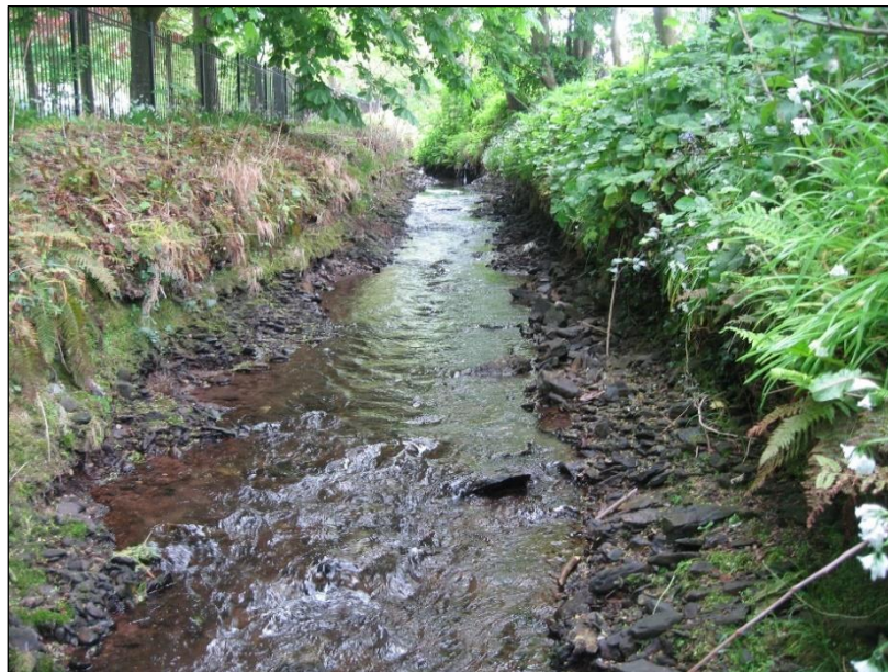
Plate 13.4: Ballybrack Stream in Douglas Community Park, looking south