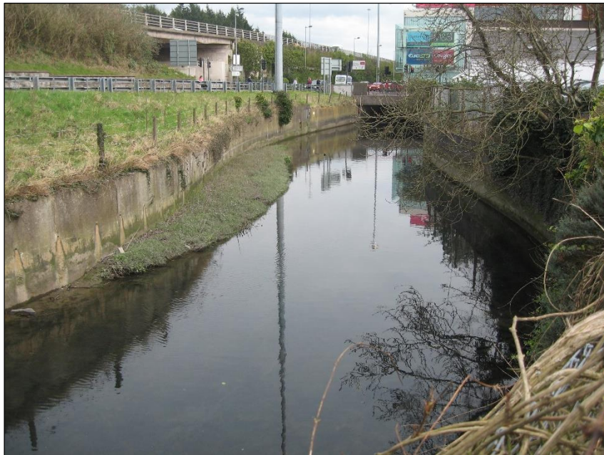
Plate 13.16: Tramore River at Douglas Mills/St Patrick's Mills, looking east