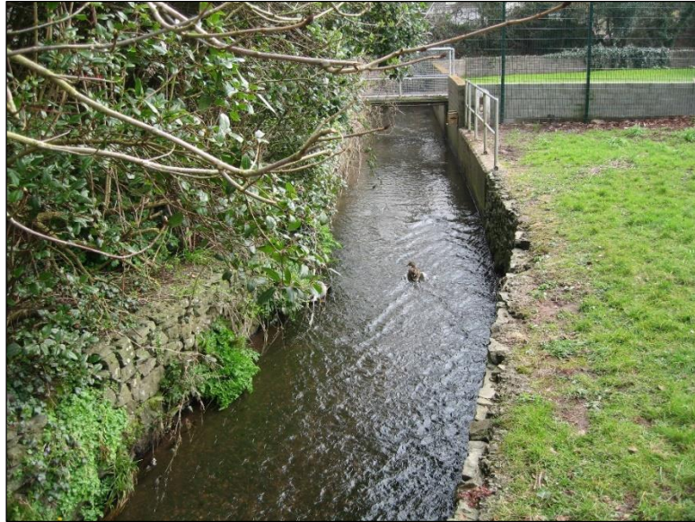
Plate 13.9: Ballybrack Stream running along Church Road with bridge to ICA visible, looking east