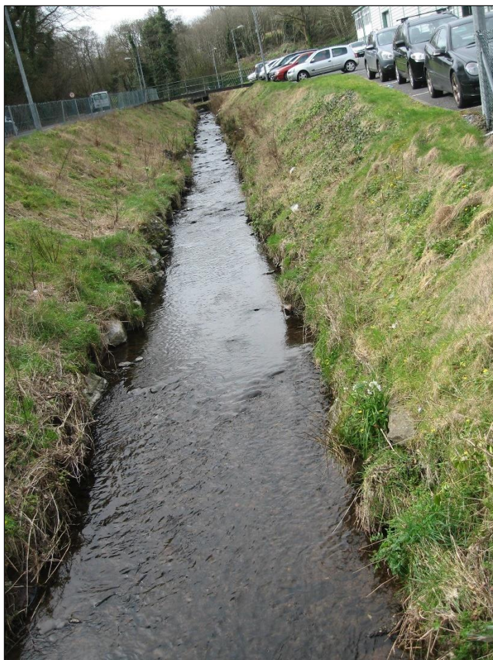
Plate 13.2: Western section of Grange Stream, looking west