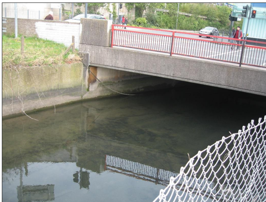
Plate 13.18: Tramore River flowing into culvert carrying it under West Douglas Street