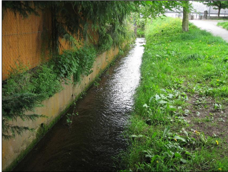
Plate 13.25: Tramore River running to the north of Greenwood Estate, looking west