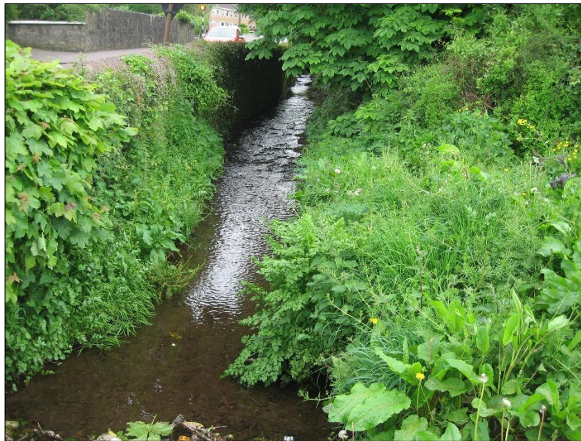
Plate 13.22: Tramore River adjacent to Lehenaghmore Road, looking south