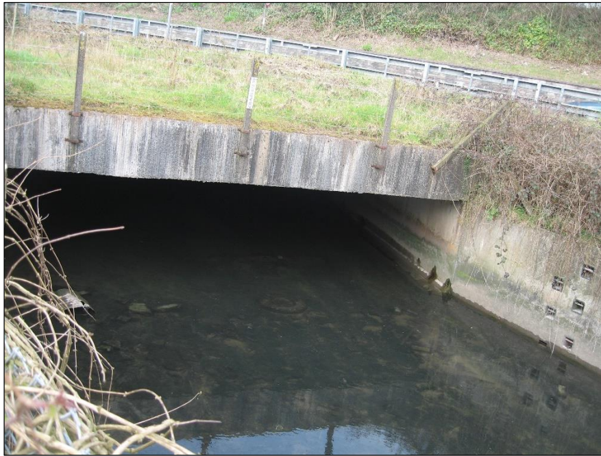
Plate 13.17: Tramore River emerging from culvert carrying it under the N40 road, looking west