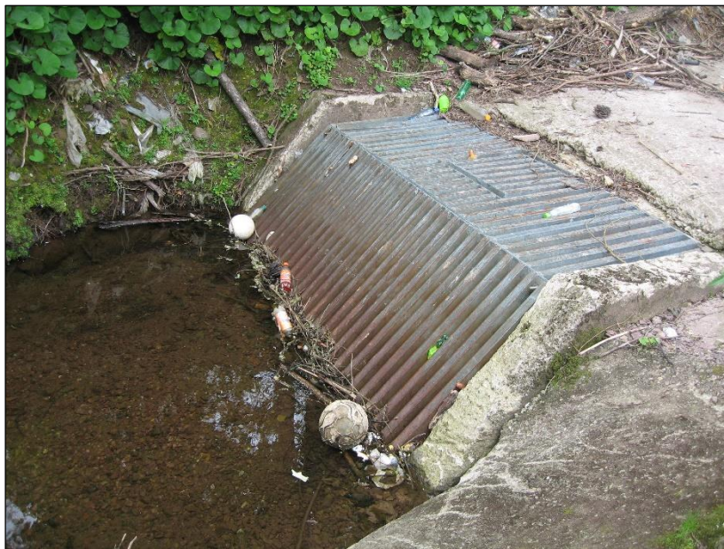
Plate 13.20: Trash screen on Tramore River in Lehenaghmore Industrial Estate, looking northeast